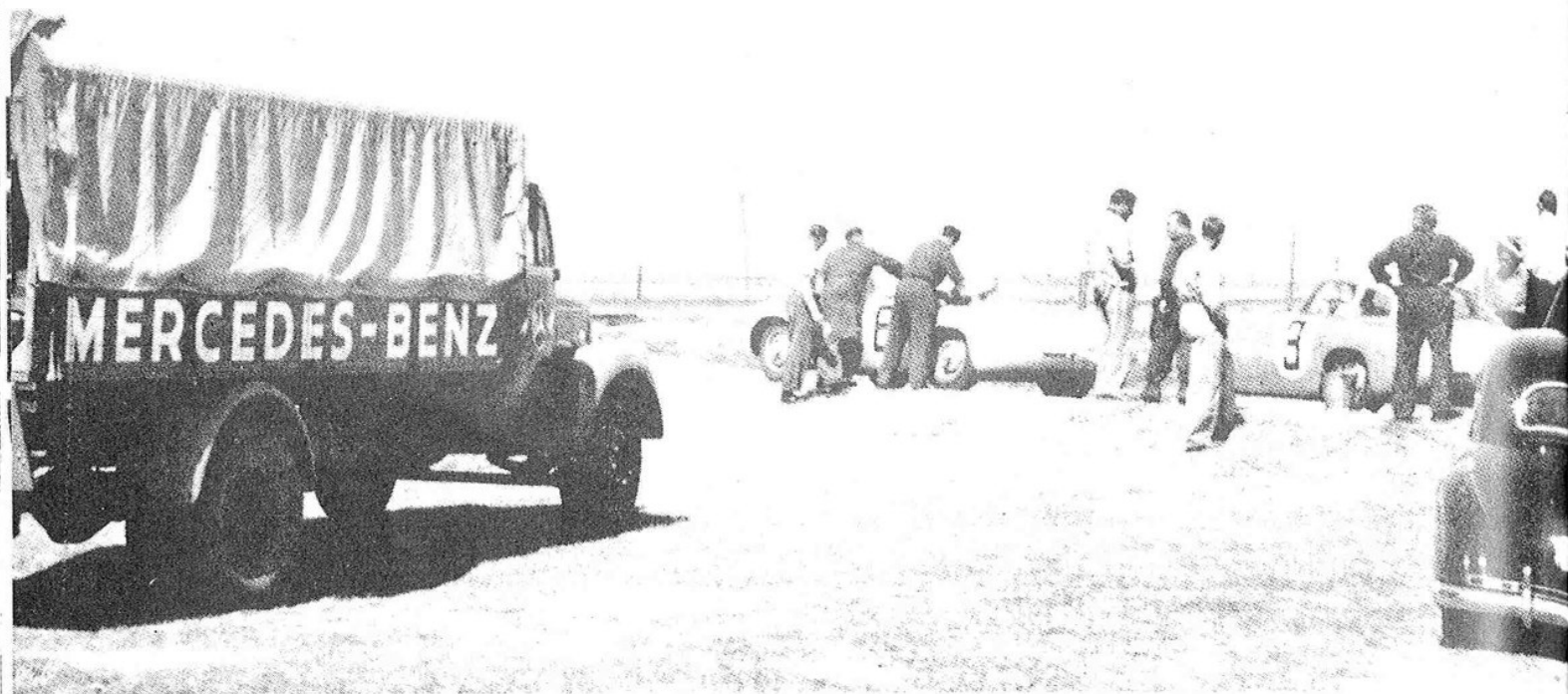
Mercedes mechanics swarm over cars along Mexican race route during secret practice. Car in right foreground is Mercedes 300 sedan. John Fitch, in coveralls, stands to left of number 3 with back turned. Methodical Germans made carburetion and spark plug tests at all altitude extremes all the course, from sea level to over 10,000 feet.