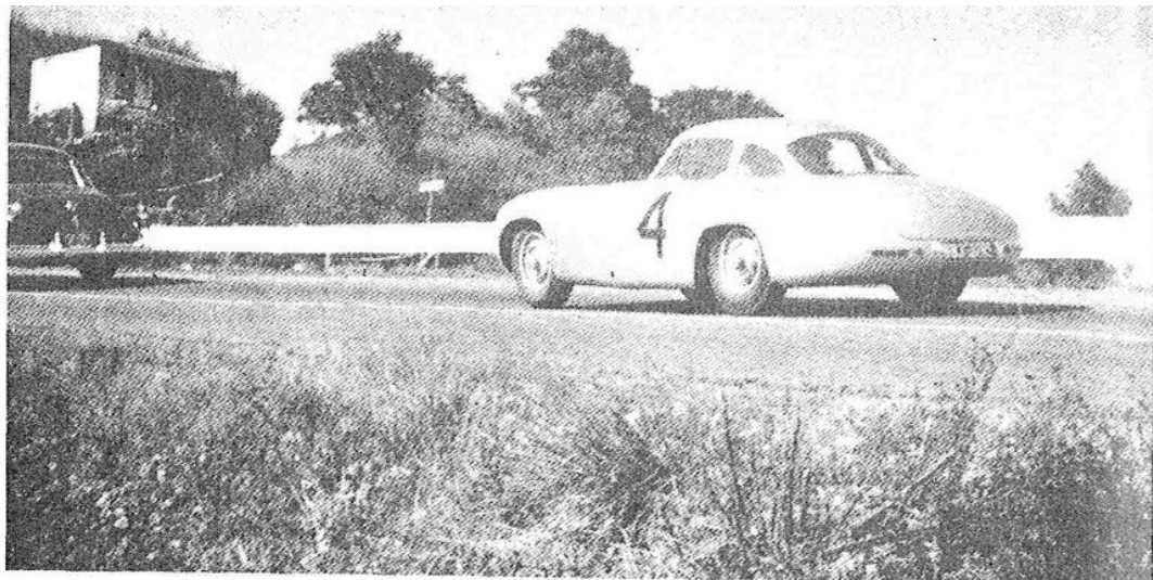
Karl Kling, in his Mercedes Benz SL 300, speeds along the Pan-American race route (above) north of Mexico City.

An Indian (right) looks up from his dugout, in which he gathers reeds, as race cars pass on Mexican race highway near Toluca. Race not only is longest classic, but probably is one of most scenic.